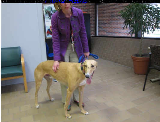
Hawk the Hero